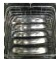
5 kidney trays holder