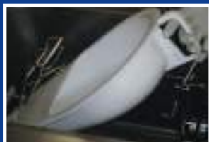
Loading of the bedpan with the handle Easy load, no risk of overflow