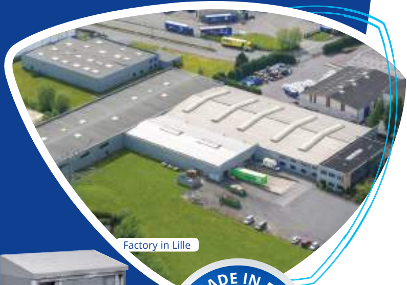
Factory in Lille