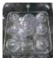
Basket for graduated glasses