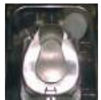
American stainless steel bedpan